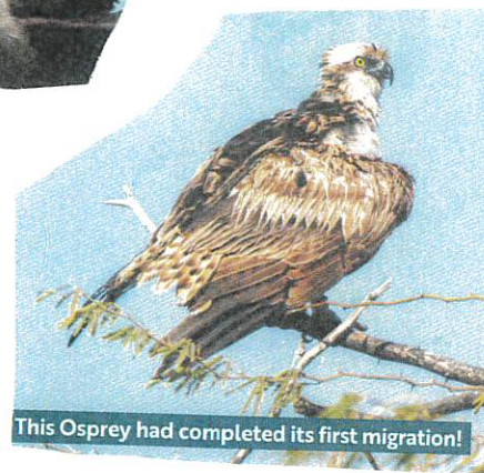
This Osprey had completed its first migration!